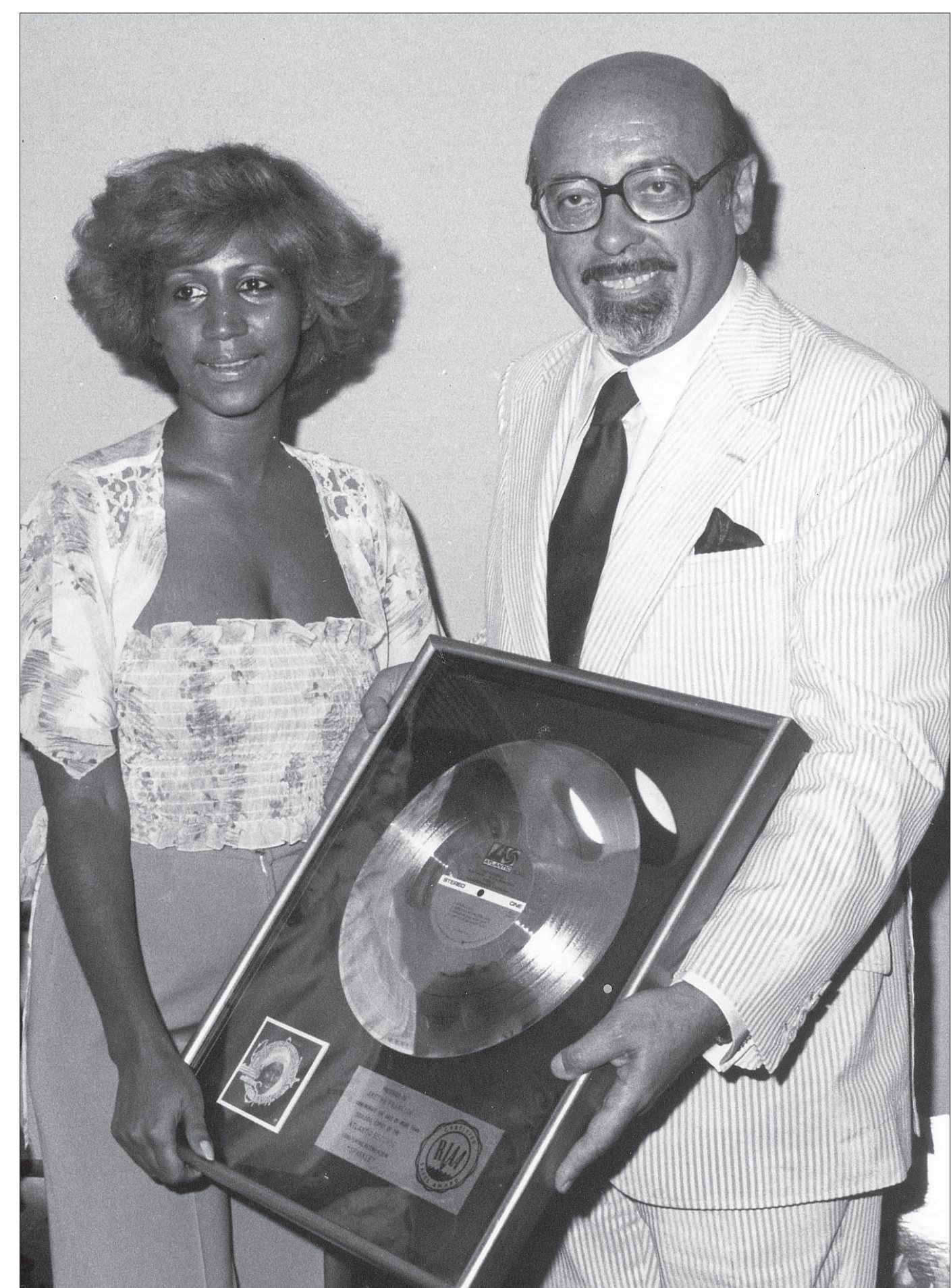
Left: “Ray Charles and Ahmet Ertegun”, Top right: “Otis Redding, Ahmet Ertegun, and King Curtis”, Bottom right: “Aretha Franklin and Ahmet Ertegun”