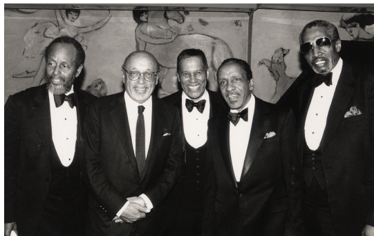
Ahmet Ertegun with the Modern Jazz Quartet