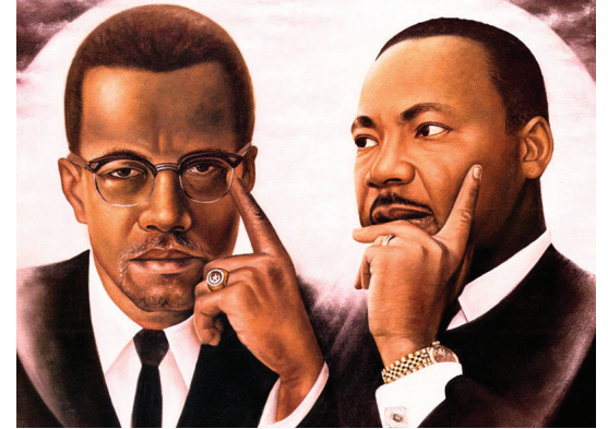
Great Thinkers, 1986