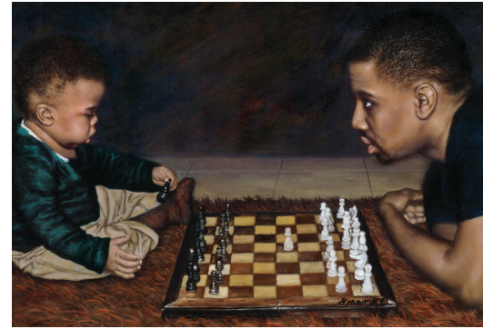
First Move, 2015