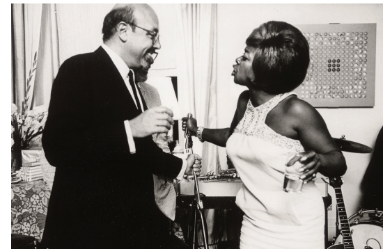
Ahmet Ertegun and Esther Phillips

Speaking to Slate Magazine about how he would like his legacy to be remembered, Ertegun said, “I’d be happy if people said that I did a little bit to raise the dignity and recognition of the greatness of African American music.”