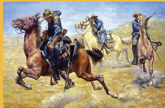
Aiding a Comrade, 1996