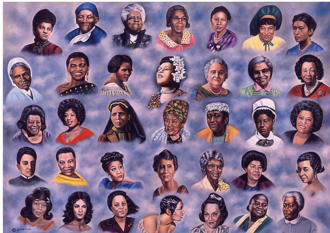
35 Great Ladies, 1989