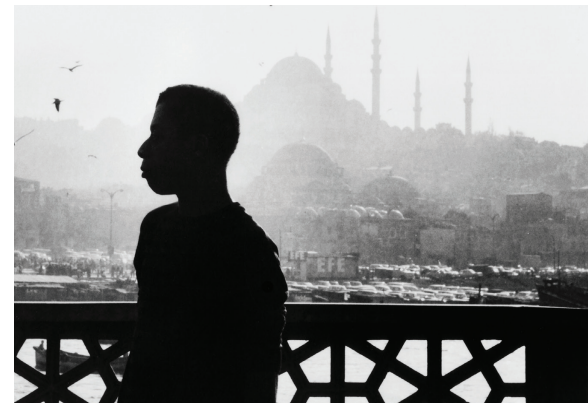
James Baldwin in Istanbul.

To this day, Baldwin's legacy remains strong in Turkey, just as Turkey left a strong impression on Baldwin's later work and his relationship to the U.S.' reckoning with race and sexuality in the latter half of the 20th century.