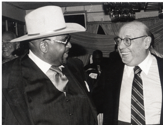
Solomon Burke and Ahmet Ertegun