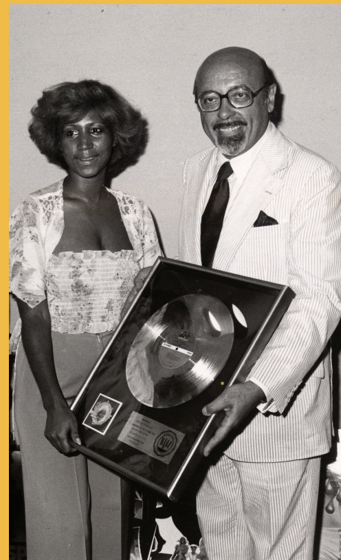
Aretha Franklin and Ahmet Ertegun