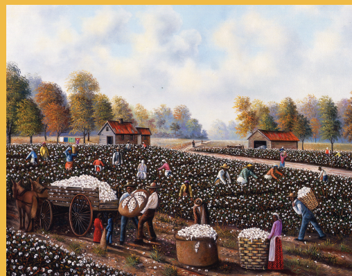
Cotton Picking, 1887