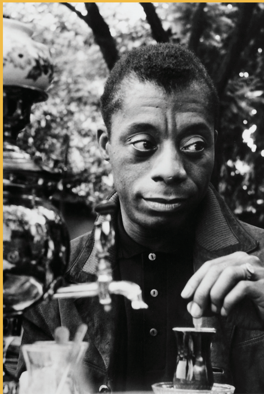
James Baldwin in Istanbul.