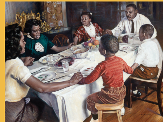
Blessing with King, 2016

In 1972, he moved to the United States, where he began making paintings of mainly African Americans, their cultures, and the subjects that define them. His main goal was to create images that would inspire African Americans to be proud of their African heritage and follow in the footsteps of their leaders. Mavruk's paintings also captured