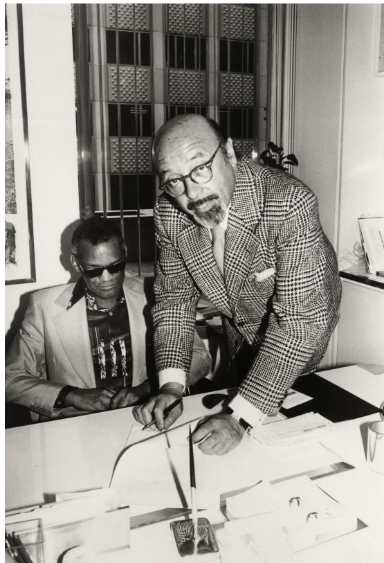
Ray Charles and Ahmet Ertegun