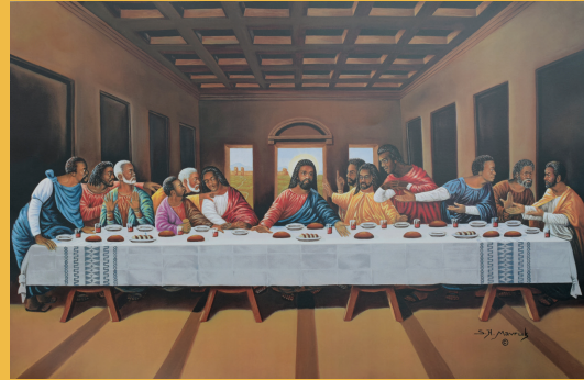
Last Supper, 1987