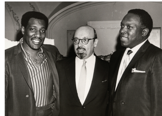
Otis Redding, Ahmet Ertegun, and King Curtis