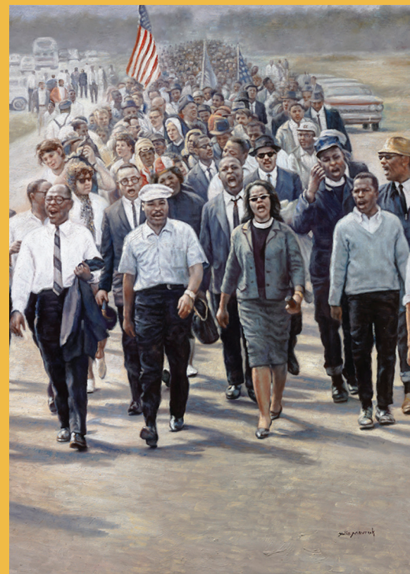
March to Freedom, 2016